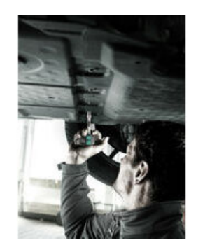
The 411 A RA T-handle is suitable for 1/4" sockets. The sockets are securely locked via the ball.