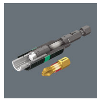
The optimally coordinated features of the torsion zones on the bit and holder permit a phased yield when under strain. The two-phase system prevents premature wear. Moreover, a long tool service life is also ensured by the hardness of the bits that matches the respective application.