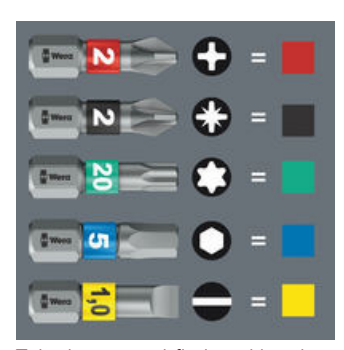
Take it easy tool finder with colour coding according to profiles and size stamp - for simple and rapid accessing of the required tool.