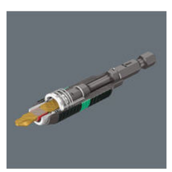
The effectiveness of the BiTorsion system comes from a combination of two shock-absorbing spring elements. Both, bits as well as holders have a cushioning torsion zone that diverts the kinetic energy away from the drive tip during peak loads.