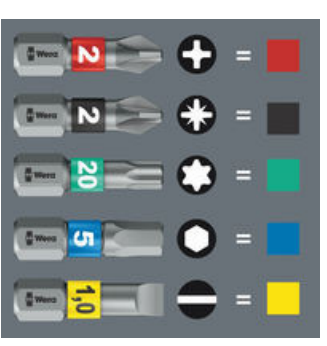
Take it easy tool finder with colour coding according to profiles and size stamp - for simple and rapid accessing of the required tool.