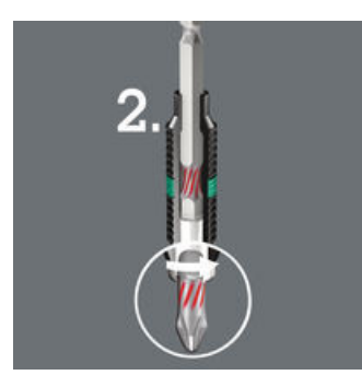
Higher peak loads are minimised through the torsion effect of the bit shaft (Phase 2).